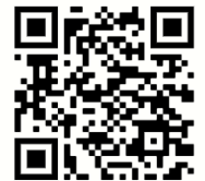
Scan to see PDF